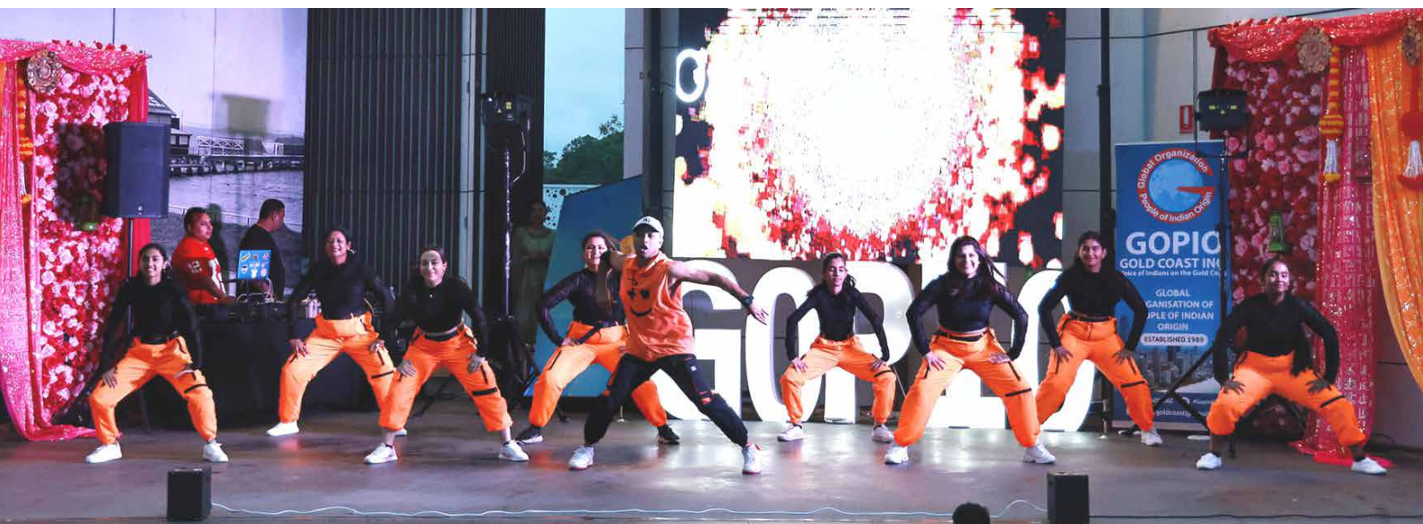
Energetic youth performance for Diwali 2023