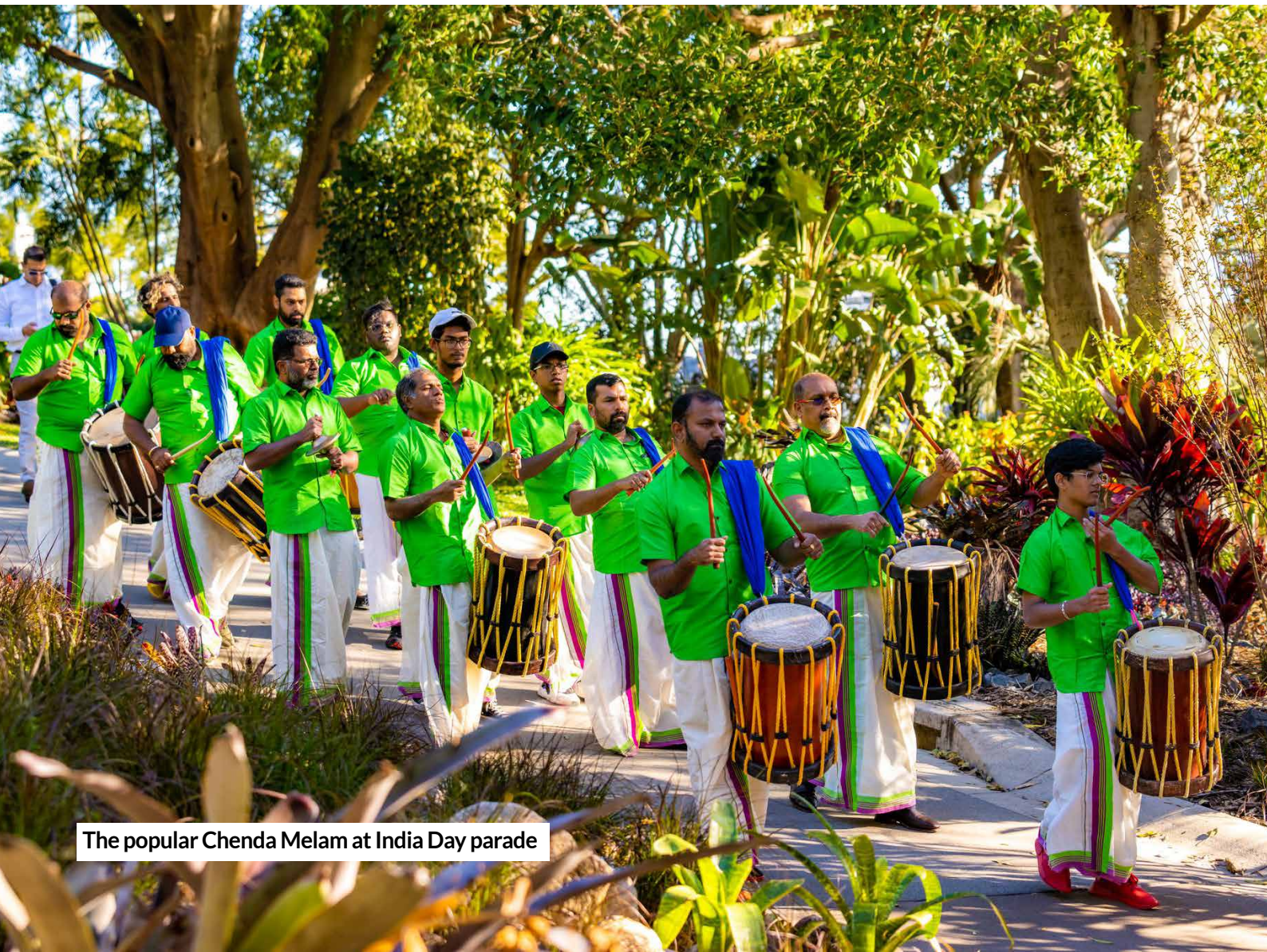
The popular Chenda Melam at India Day parade