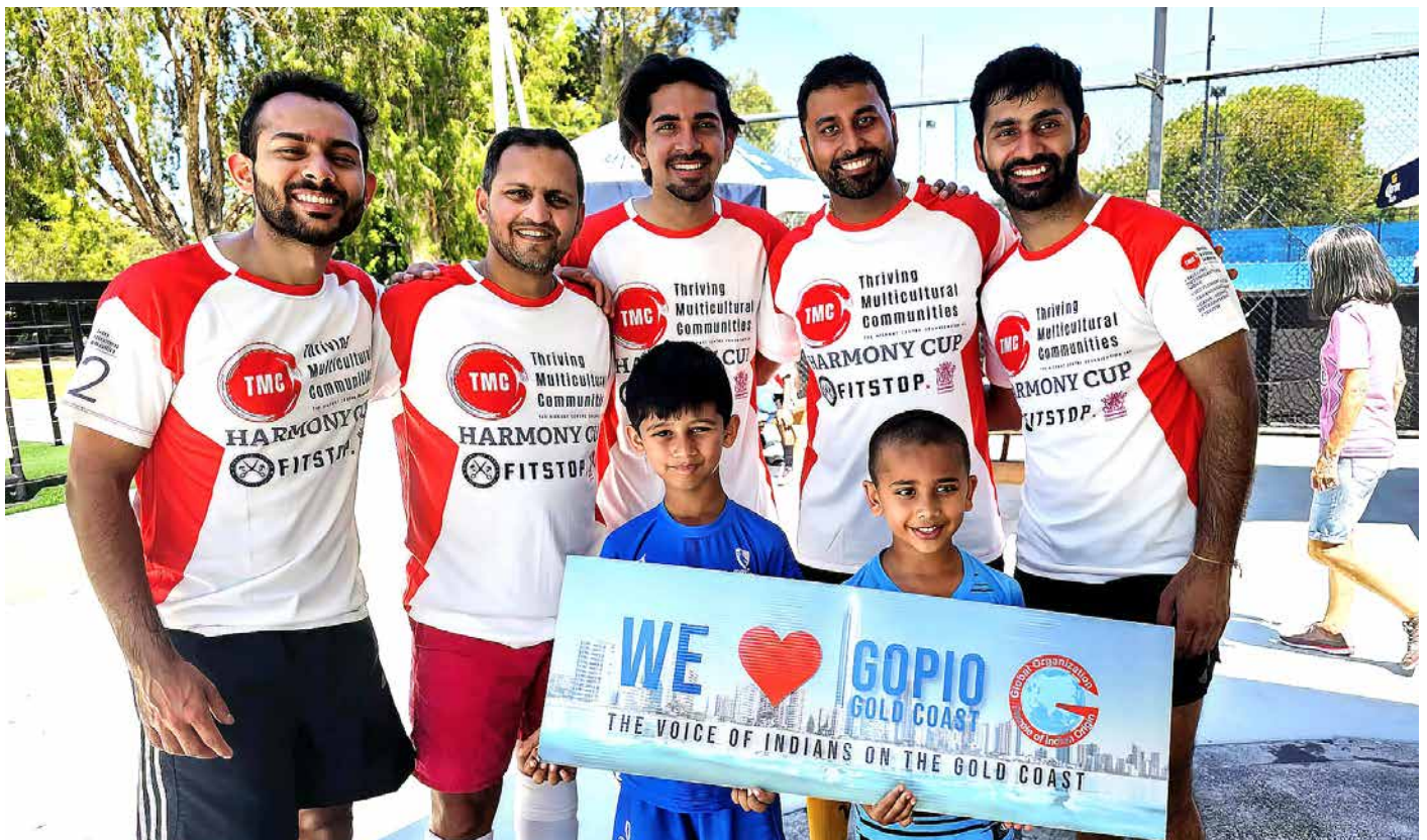
GOPIO GC team participated in a soccer tournament organised by Thriving Multicultural Centre