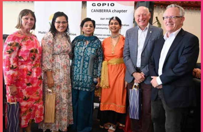
GOPIO Canberra celebrated Diwali on 3rd December with the community, politicians and Indian high commission