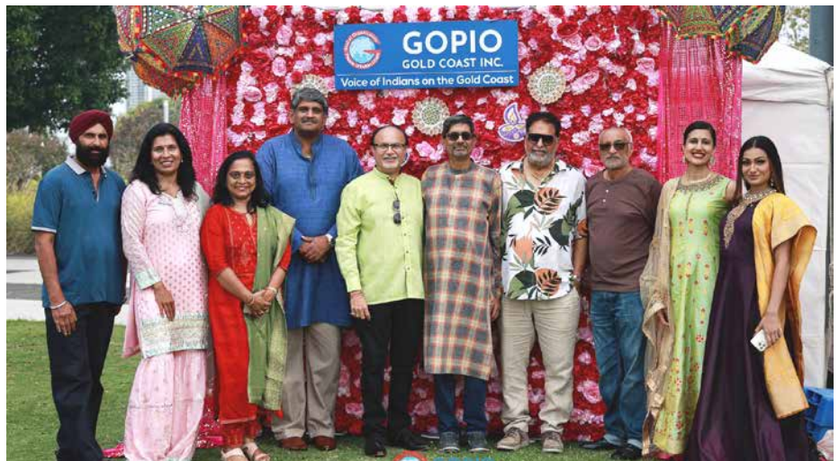
GOPIO Gold Coast team and community leaders