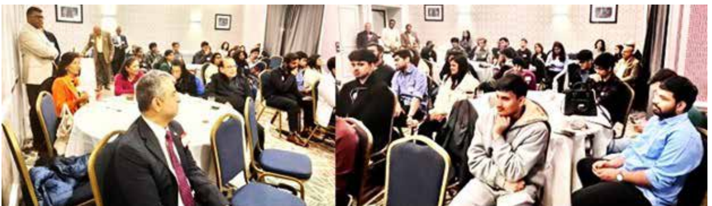
Students and GOPIO Members among the audience