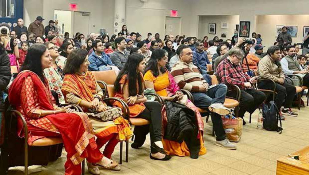
Audience at the houseful event

folk as well as Bollywood dances. Indian delicacies served after the event were enjoyed by all.