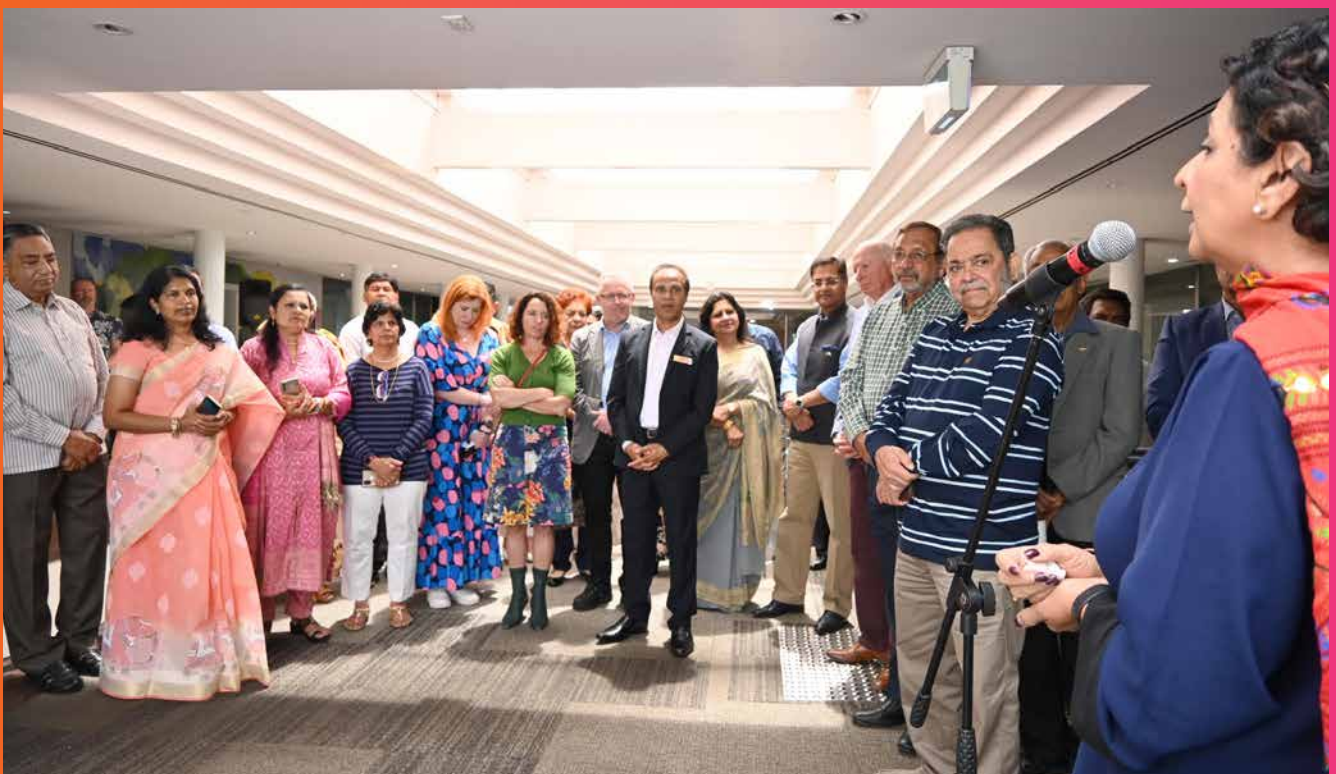
Australia day celebrations by GOPIO Canberra 26th January 2023