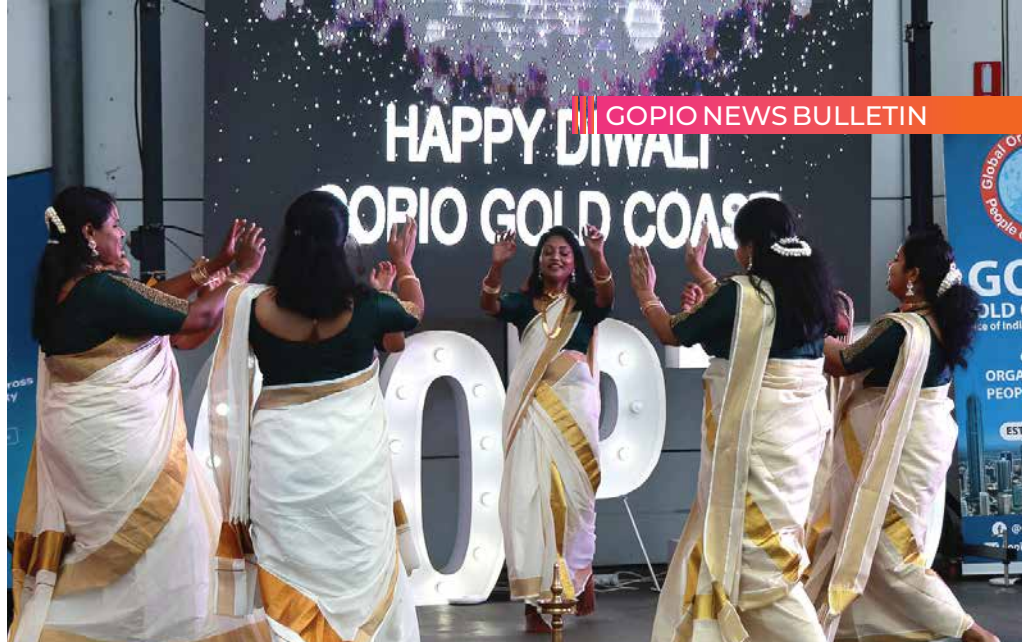
Dance performance by Malayalee group of Gold Coast

everyone who attended the event and wholeheartedly supported it to make it a huge success. A special thanks to the