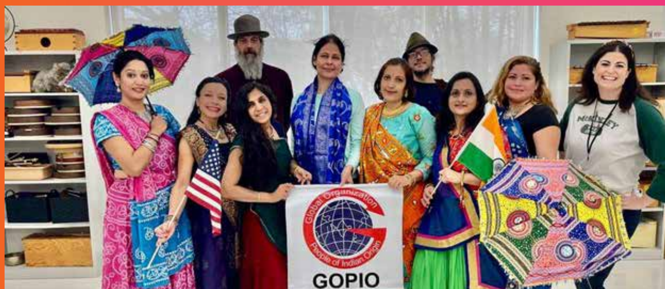
GOPIO-CT represented India at the One World One Celebration at the McKinley School in Norwalk on December 2nd.