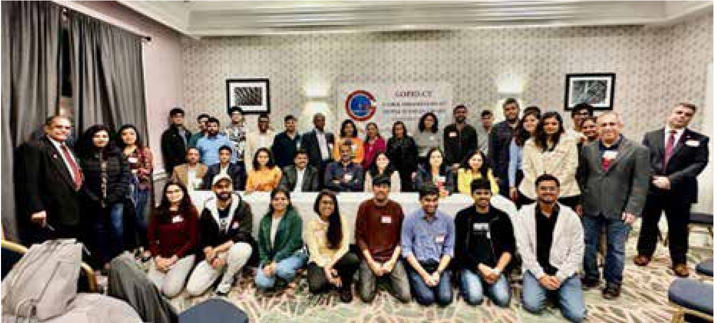
Students, panelists and GOPIO-CT organizers at the Students Meet and Greet Event