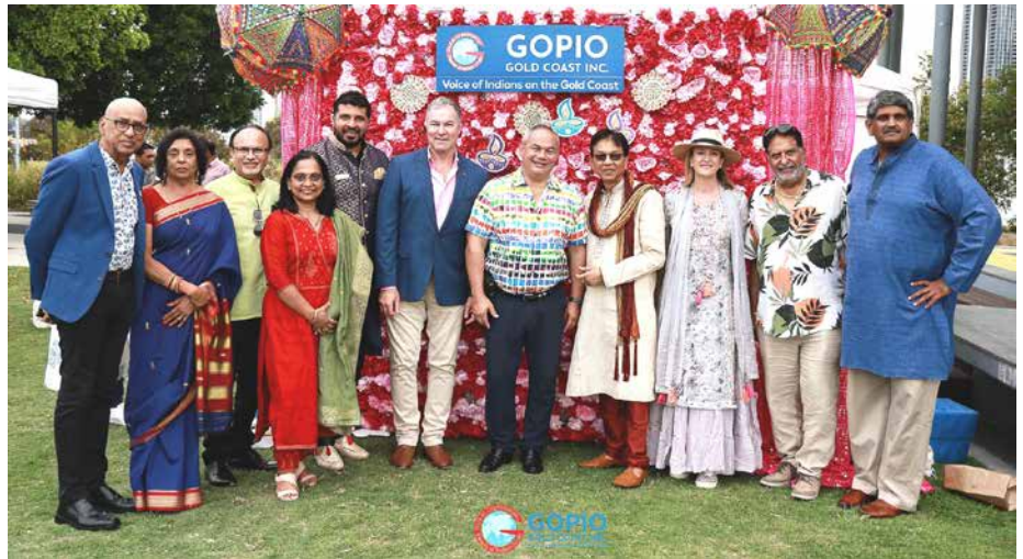
GOPIO and FICQ leaders with Mayor Tom Tate, Shadow Minister of Multiculturalism John-Paul Langbroek and Councillor Brooke Patterson