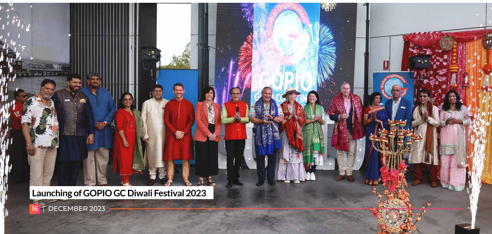
Launching of GOPIO GC Diwali Festival 2023