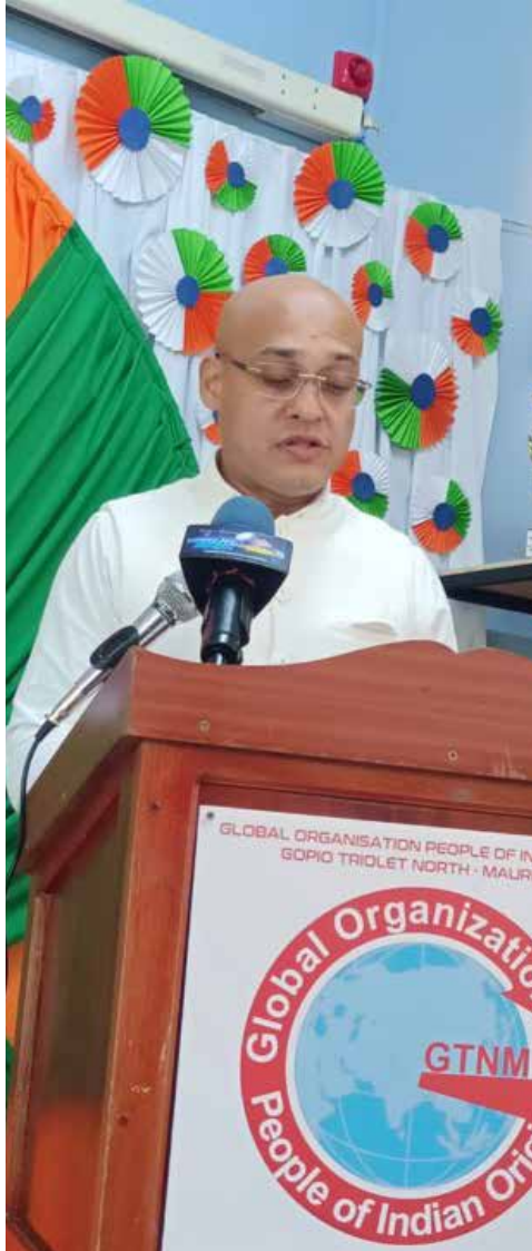
Minister of Employment and Labour Hon Soodesh Callychurn

The function was a great success and culminated with some Bhojpuri songs, dances, and a yummy traditional Indian food buffet.