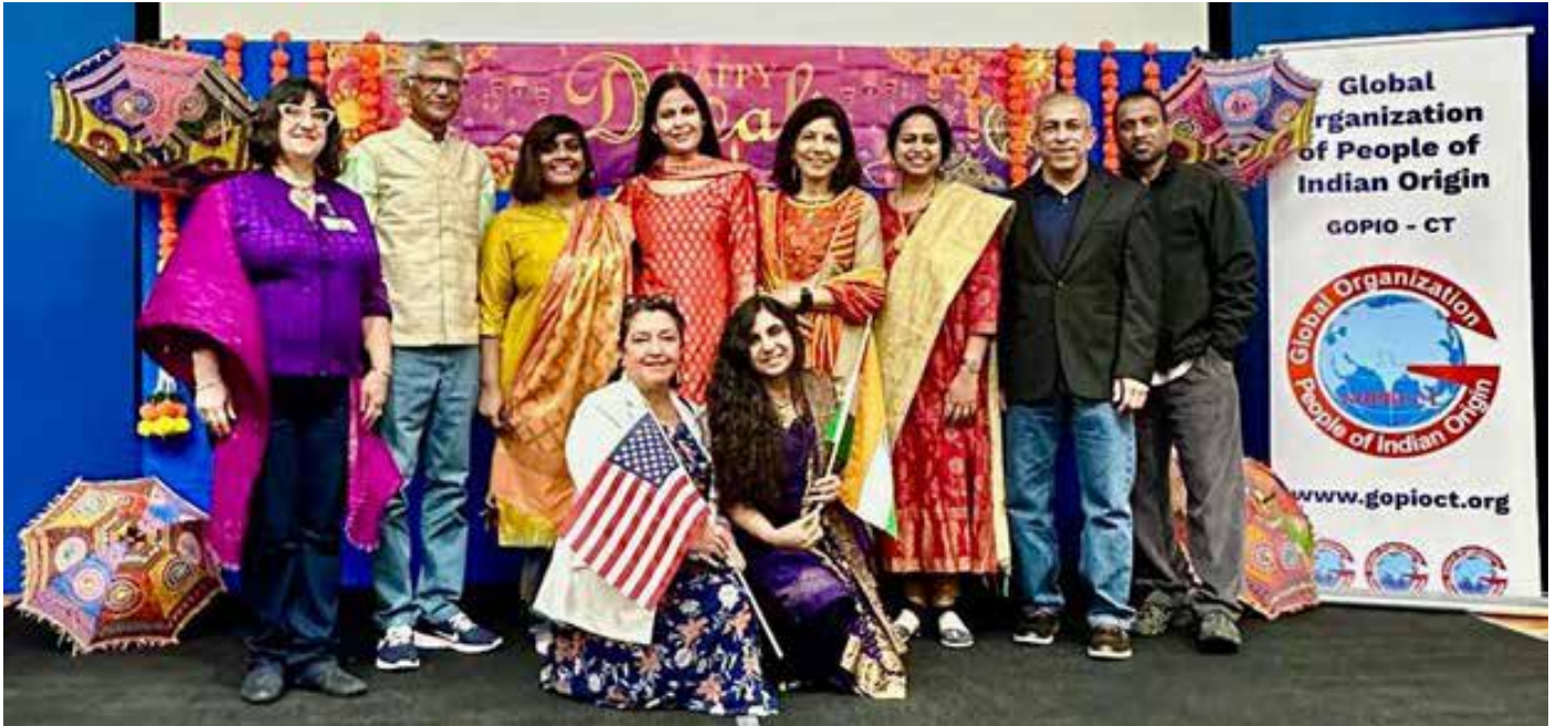
Organizers from GOPIO-CT, Stamford Multicultural Council and the Public Library at the event

D iwali, the Indian Festival of Lights, was celebrated by the Connecticut chapter of GOPIO (Global Organization of People of Indian Origin) in partnership with the Ferguson library and the Stamford Mayor's Multicultural Council (MMC) with traditional music, dance, Mehendi, Indian snacks and a rangoli exhibition.