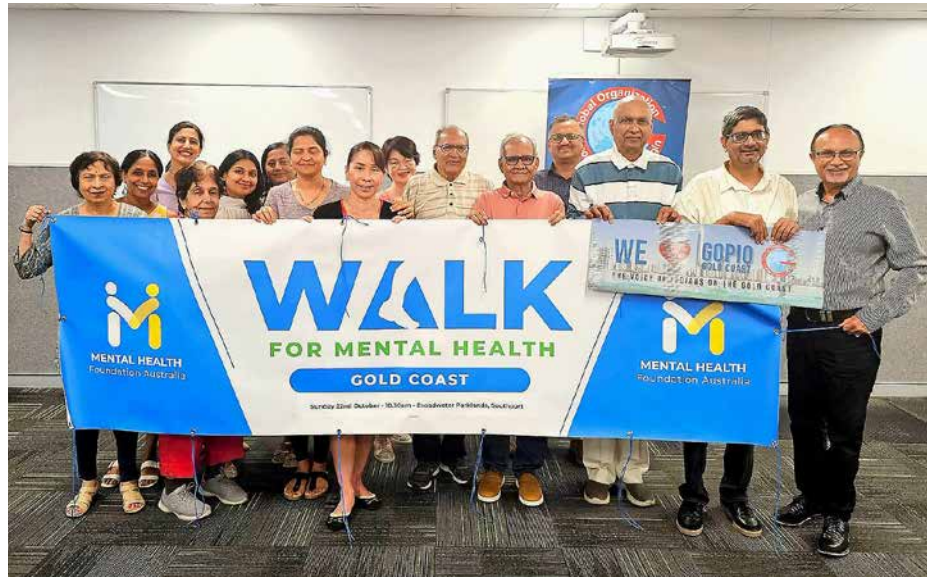
Launch of Mental Health Walk with Mental Health Foundation Australia