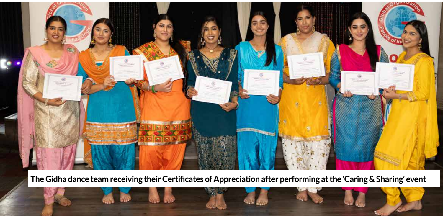
The Gidha dance team receiving their Certificates of Appreciation after performing at the 'Caring & Sharing' event