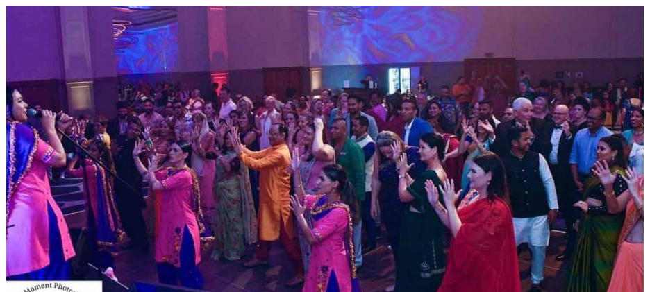
The popular Bollywood workshop by Dance Masala Troop