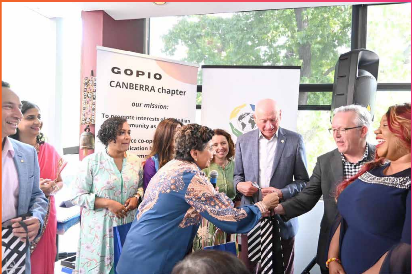
GOPIO Canberra celebrated International Women's Day in collaboration with Multicultural Association of Canberra