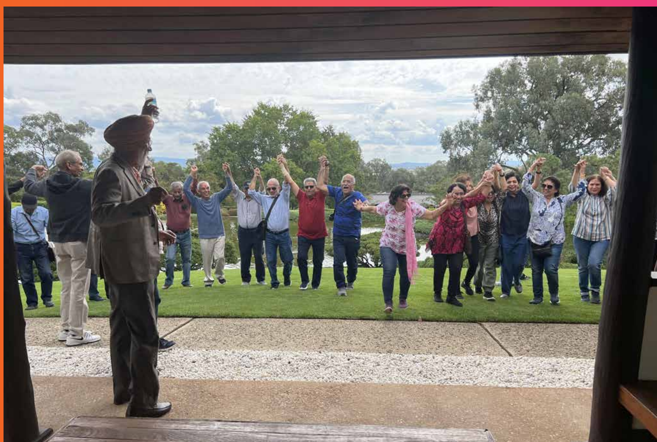
GOPIO Canberra organized a bus trip for the Indian community to celebrate Holi and Harmony Day on 26th April 2023