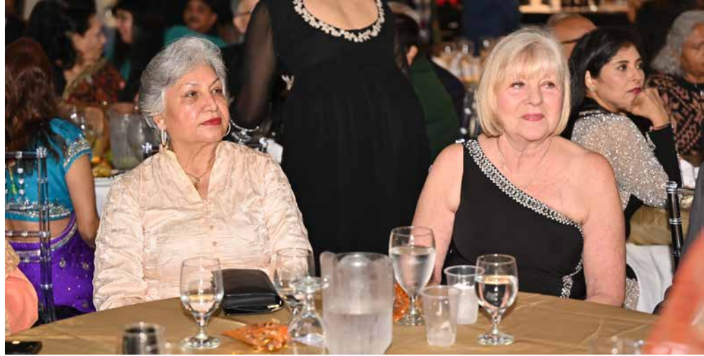
Step2stepup honoring successful women in the nation 2023 - GOPIO-IE supporting

Step2StepUp Inc. celebrated International Women's Day on March 8, 2023, and honoured 24 successful women and 24 Young Student Entrepreneurs.