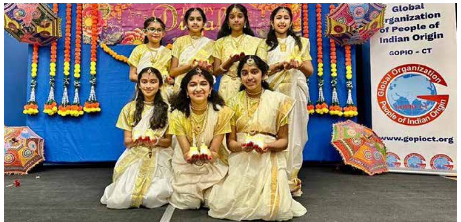
Pooja Dance by a dance school from Connecticut

The highly successful Diwali program for the 3rd year in a row, was presented with 75 artists to a houseful crowd on November 19th at the Ferguson Library in Stamford, Connecticut. The GOPIO chapter has been promoting the soft power of India and the Indian Diaspora to the larger society since 2006.